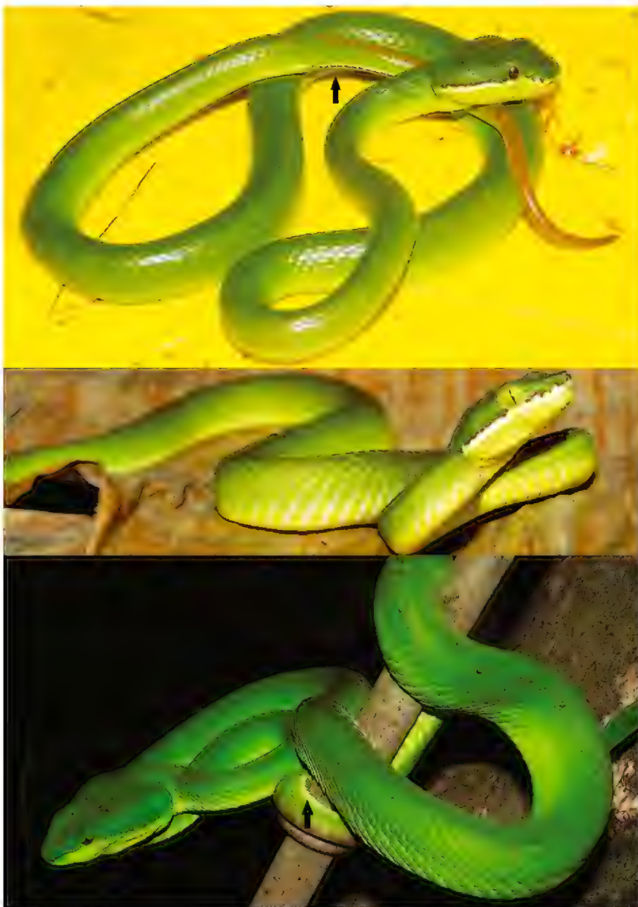
Fig. 2. Trimeresurus davidi sp. nov. in life from Car Nicobar (top and middle: males, bottom: female).

Holotype. BNHS 3304, an adult female from Chuckchucka Village (9.2161°N, 92.8109°E, 14 m asl), Car Nicobar, collected by a group of Nicobari men ( vide Vijayakumar and David 2006).